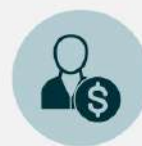
Ultra-High-Net-Worth Individuals Individuals With Liquid Assets of More Than $30M