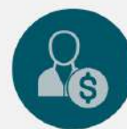
Very-High-Net-Worth Individuals Individuals With Liquid Assets of $5M to $30M