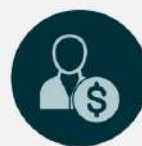
High-Net-Worth Individuals Individuals With Liquid Assets of $1M to $5M